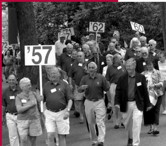
The Parade of Alumni on Alumni Weekend helps renew lifelong friendships.

It has often been said that change is the only constant in life. If you are like most Gunnery alums, you have experienced many changes since your student days—attending college, marrying, having a family, buying homes, progressing in your career or moving to another state, just to name a few.